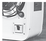
3 Pole, 600V Rating